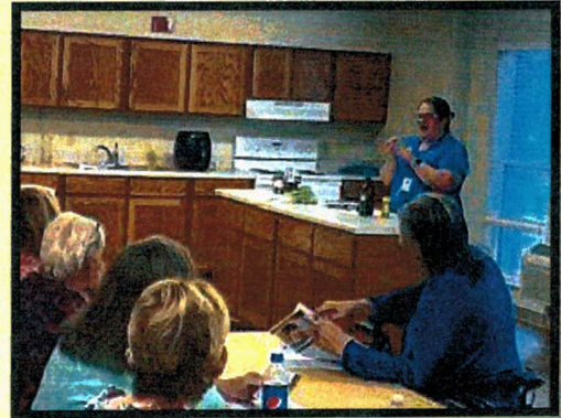
Field Trip to the Heart of Kentucky Quilt Show at the Hardin County Extension Office